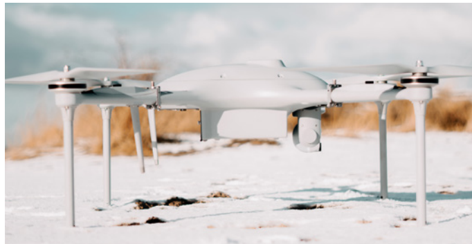
Copyright © 2024 Height Technologies. All rights reserved.

In case of loss of GNSS/GPS or during a jamming or spoofing attack, the system automatically initiates Dead Reckoning Mode, enabling it to fly in GNSS-denied areas.