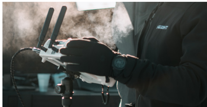
Martlet MI-2S Datasheet v7